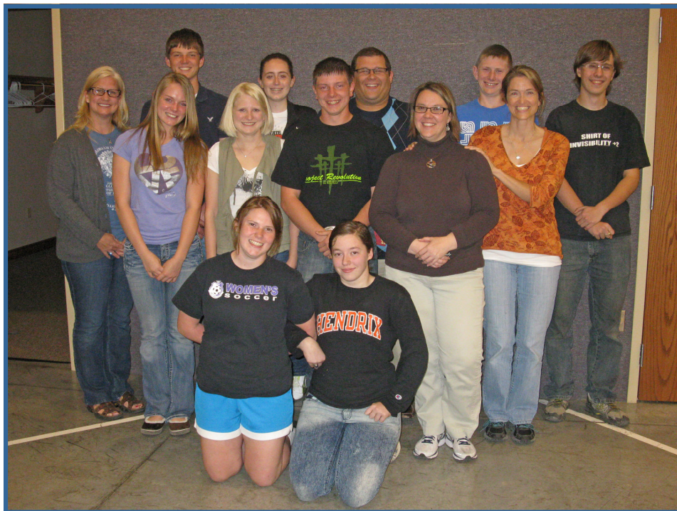
District Council of Youth Ministry 2012-13