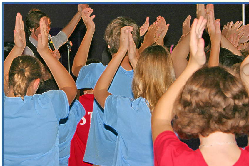
1st Project Revolution