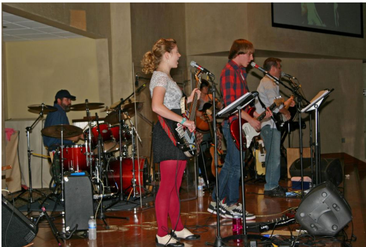
Band for 2011 The Mashup